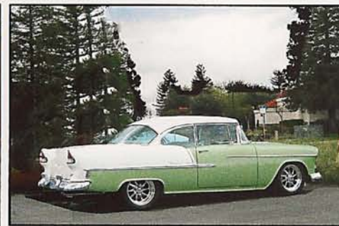
Dub & Bonnie Kyle's 55 Bel Air